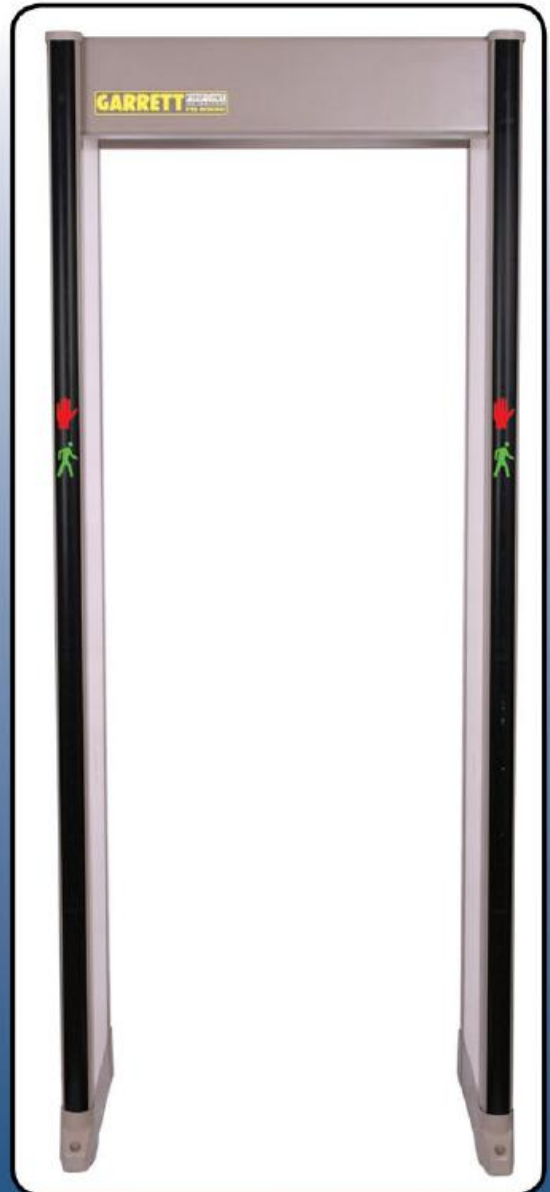
ABOVE: (Entrance view) International pacing lights illustrated.