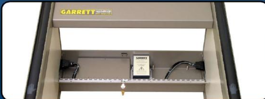
LEFT: All connections, wires and electronics to the PD 6500 i are securely enclosed within the locking Detection Head.